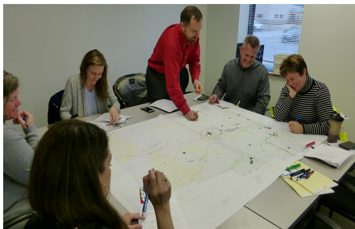
Steering Committee members participating in the strong and weak places exercise.