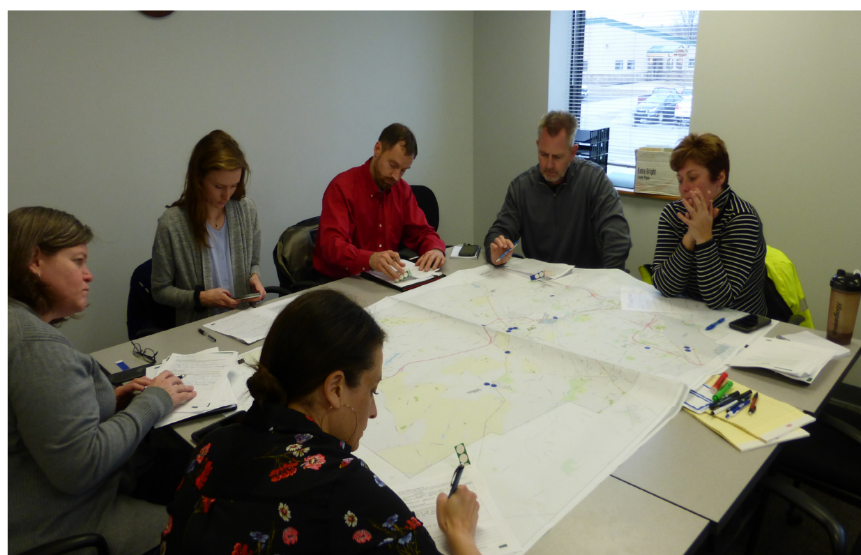
Steering Committee members participating in the opportunity places exercise.